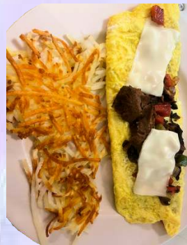
Philly Cheese Steak Omelette