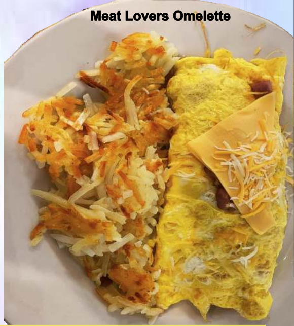
Meat Lovers Omelette

Health Advisory: Eating raw or undercooked meat, poultry, eggs or seafood poses a health risk to everyone, but especially to the elderly, children under age four, pregnant women and other highly susceptible individuals with compromised immune systems. Thorough cooking of animal foods reduces the risk of illness.